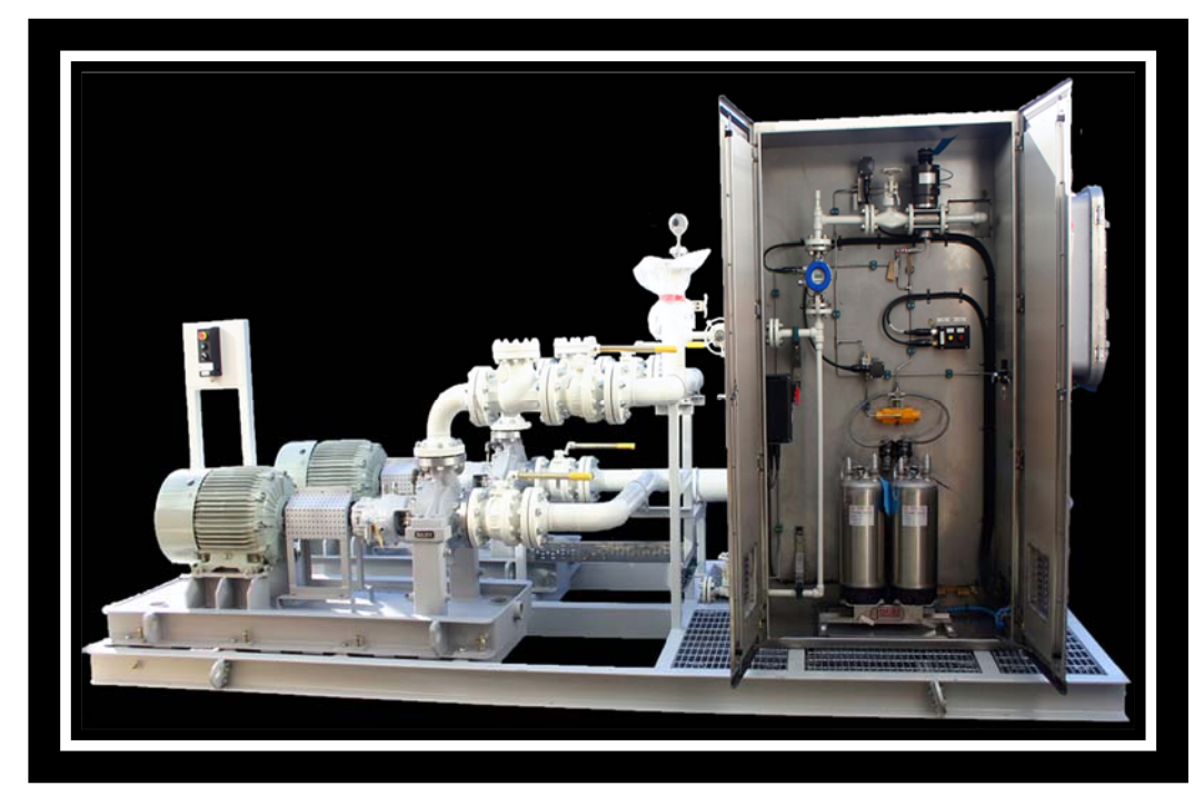
Figure 4 - Jet Mix Sampling System