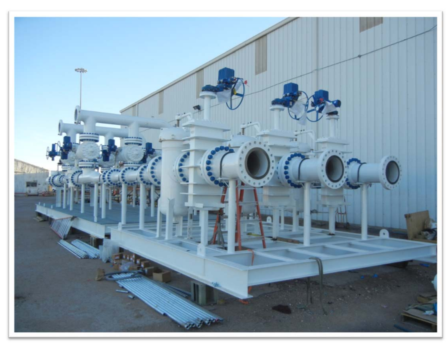
Figure 2 – Triple Turbine Meter Measurement Station